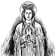
Oh Mary, we crown thee with blossoms today

The grass is green, the flowers have sprung, which First Communicant will be the one? All parishioners, PSR students, families, friends and especially this year’s First Communicants and Confirmandi are invited to attend the parish’s May Crowning on Monday, May 6 th at 7pm in the church. The evening will begin with the 2nd graders processing into the church in their First Communion attire. Many favorite Marian hymns including Ave Maria, On This Day O Beautiful Mother, and Bring Flowers of the Rarest (just to name a few) will be sung, the poem Lovely Lady in Blue will be read, the Joyful Mysteries of the Rosary will be prayed, and the statue of Mary will be crowned. A very lucky First Communicant will be randomly chosen from all the students present at 6:45pm in a drawing on the day of the service. The evening will conclude with an Ice Cream Social in the hall.